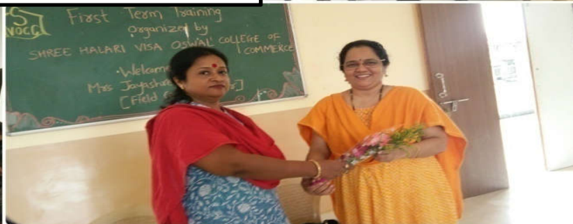
1st Term training