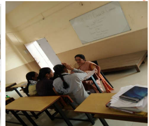
2nd Term Training